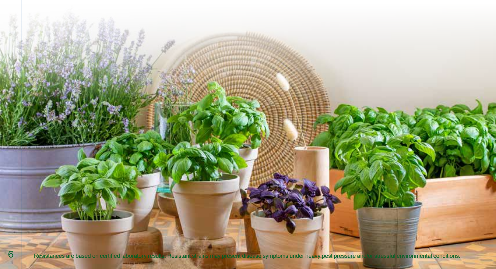
Fob - Fusarium oxysporum f. sp. basilici • Dm - Downy Mildew resistance (Pb) • IR - Intermediate resistance • 🌉 - Cut • 🍟 - Pot • 👨 - Processing