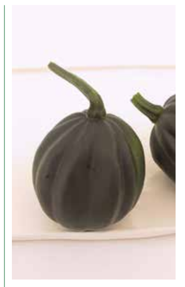
Table Sugar™, F1

Oblong orange spaghetti squash. Fruit skin can range from ivory to orange due to carotene accumulate. Orange flesh. Open growth habit and high yield potential. Non-branching.