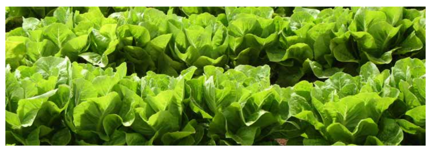
{\bf Dm} - Downy Mildew Tolerance • {\bf Pm} - Powdery Mildew Tolerance • {\bf Tb} - Tip Burn