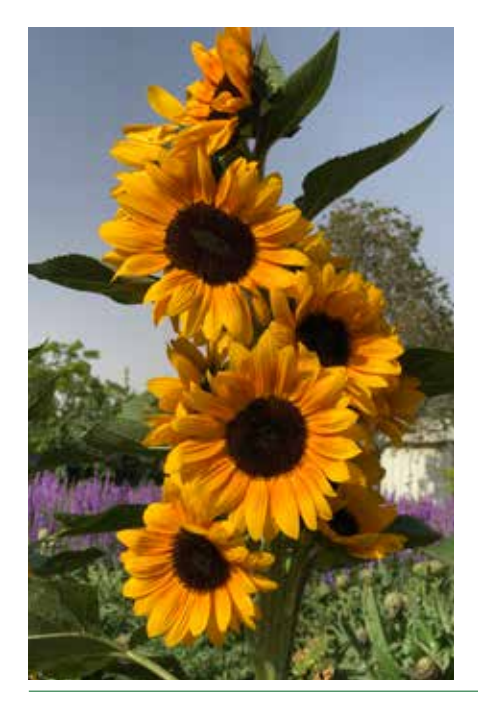
Golden Ray, F1

A unique "Gladiola" flower arrangement along the stem. Excellent for a cut flower as well as a garden ornament. Best performance when top flower removed.