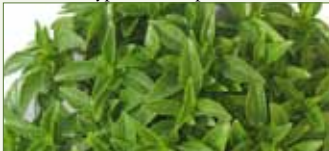
Greg (G) Greek basil type, Dome shape