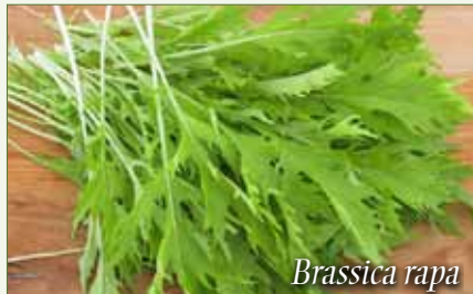
Mustard Lahav-Mizuna (G)