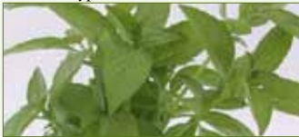
Sweet Aroma 1, F-1 (G) (ARO) Genovese type, Fusarium tolerance