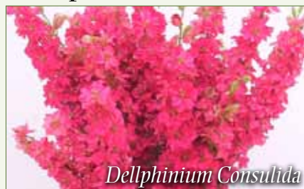
Larkspur Galilee Carmin (G)