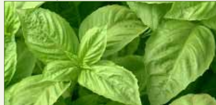
Sweet Nufar, F-1 (G) (ARO) Italian large leaf type, Fusarium tolerance