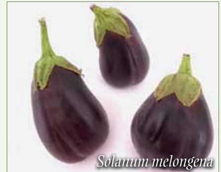
Eggplant Black Beauty (G) Favorite, selected traditional cultivar