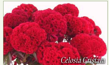
Celosia Red Flame (G)