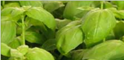
Sweet Aroma 2, F-1 (G) (ARO) Best Genovese type, Fusarium tolerance