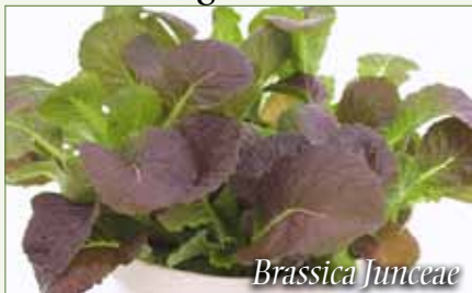
Mustard Segal-Osaka (G)