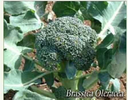
Broccoli Calibrese (G) Very nutritional, uniform selection