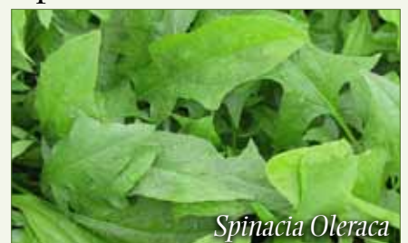
Spinach Galilee (Sbanach) (G)