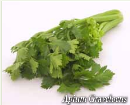
Celery leaf Early Belle (G) Productive, uniform and very tasty