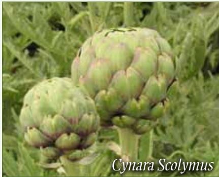
Artichoke Tavor (G) High quality Imperial star selection