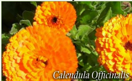
Calendula Maayan (G)