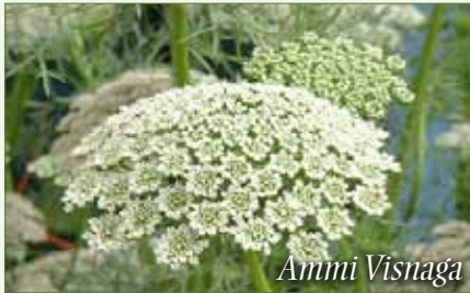
Ammi Snow white (G)