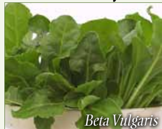
Swiss Chard Whity (G)