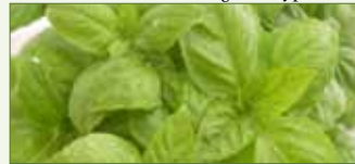
Chen (G) (ARO) Most Productive, Italian Large Leaf Type