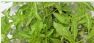
Lime (G) Citrus Flavor, Lime Aroma