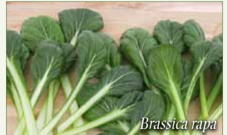
Mustard Green coin-Tatsoi (G)