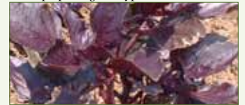
Petra (G) Dark purple, large leaf type