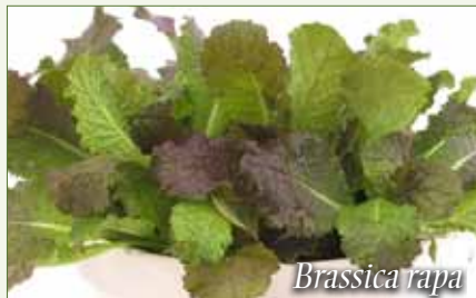
Mustard Red Giant (G)