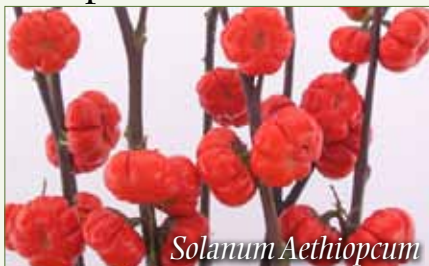
Pumpkin On-A-Stick (G)