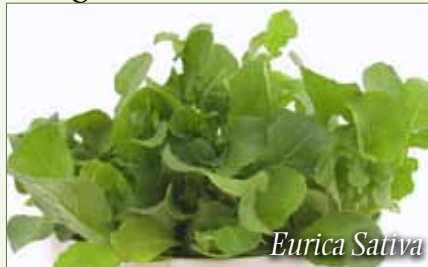
Arugula Cultivated (G)