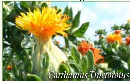
Chartamus Orange Head (G)