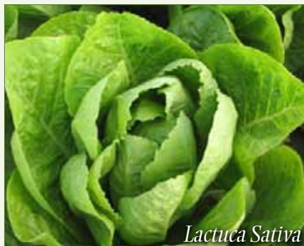
Lettuce Super Jericho (G) Our number 1 Romaine Lettuce