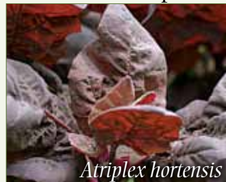
Orach-Mountain spinach (G)