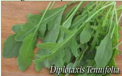
Arugula Rocky Wild (G)