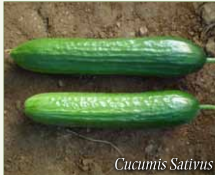
Cucumber Eve (58) (G) Beit Alfa, Indoor, fall spring ,PMT,CVYMT