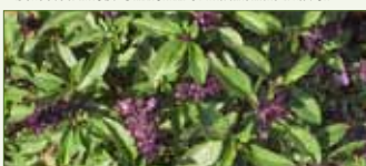
Sweet Thai (G) Selected Most Uniform & Authentic Flavor