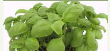
Super Sweet Ashalim (G) True Genovese type, pot plants & open field