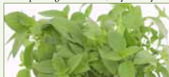
Limon (G) Low Spreading, Small Leaves, Very Lemony