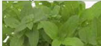
Adino (G) Fino Verde type, Miniature leaves