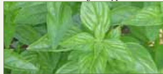
Sweet Aroma 4 (G) (ARO) Medium size, Italian large leaf type