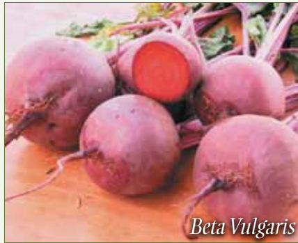
Beet Aviv (G) Globe dark red, selected for root uniformity