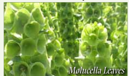
Moluccela Country Bells (G)