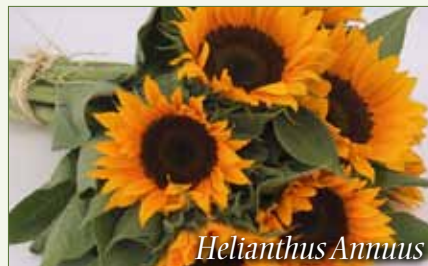
Sunflower Zohar, F-1 (G)