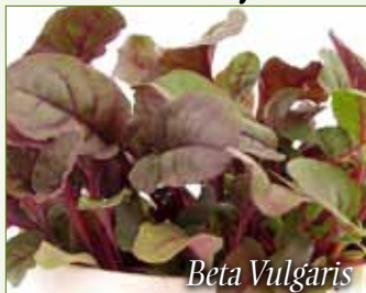
Swiss Chard Ruby Red (G)