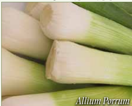
Leek Alto (G) Selected , tall Bulgarian type, very popular